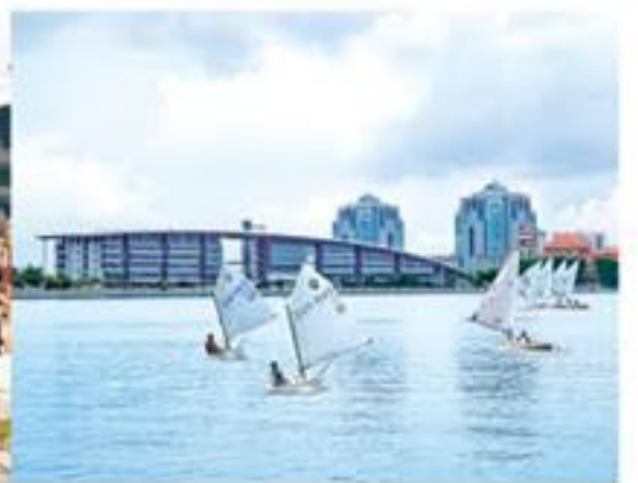
Heriot-Watt University Malaysia