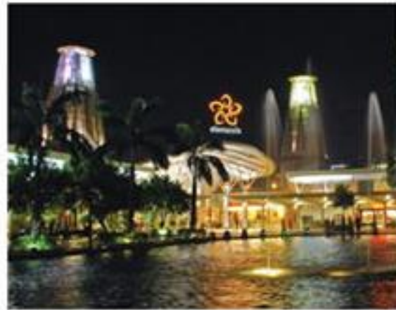
Alamanda Shopping Centre