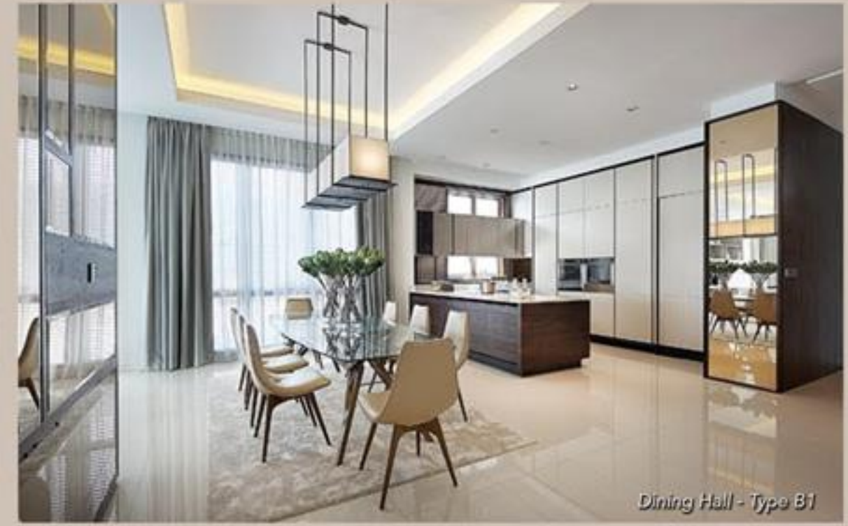
Dining Hall - Type B1