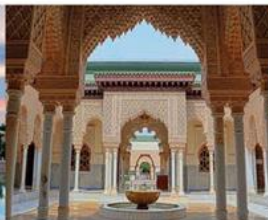
Moroccan Pavilion Putrajaya