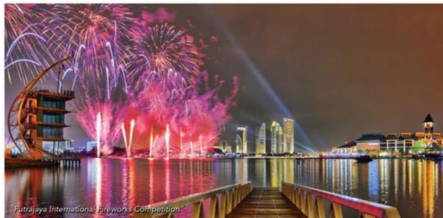
Putrajaya International Fireworks Competition