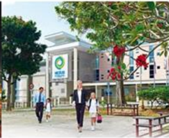
Nexus International School