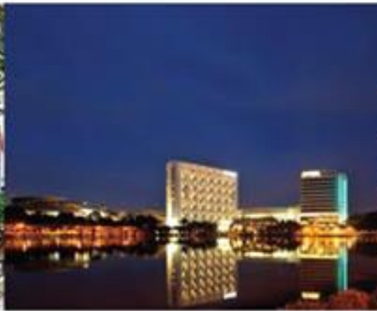
The Everly Putrajaya Hotel