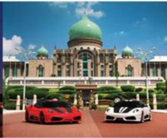
Prime Minister's Office