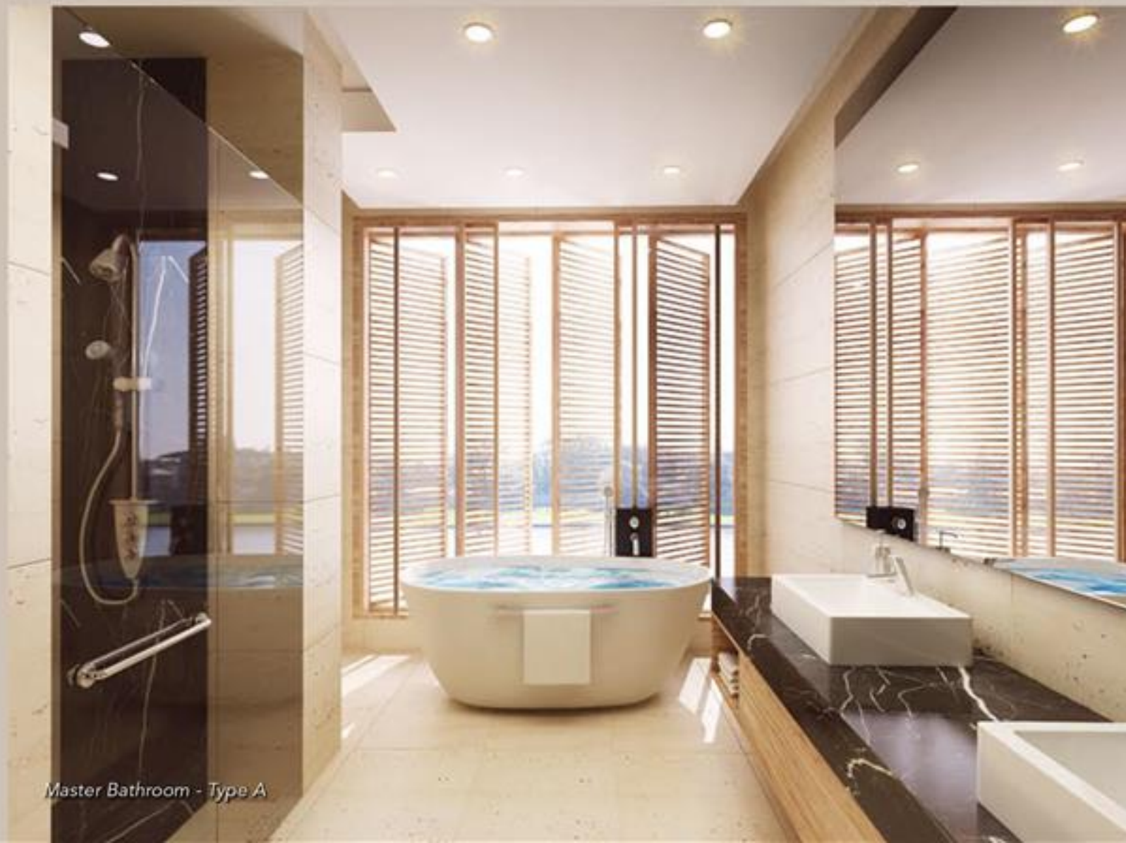
Master Bathroom - Type A