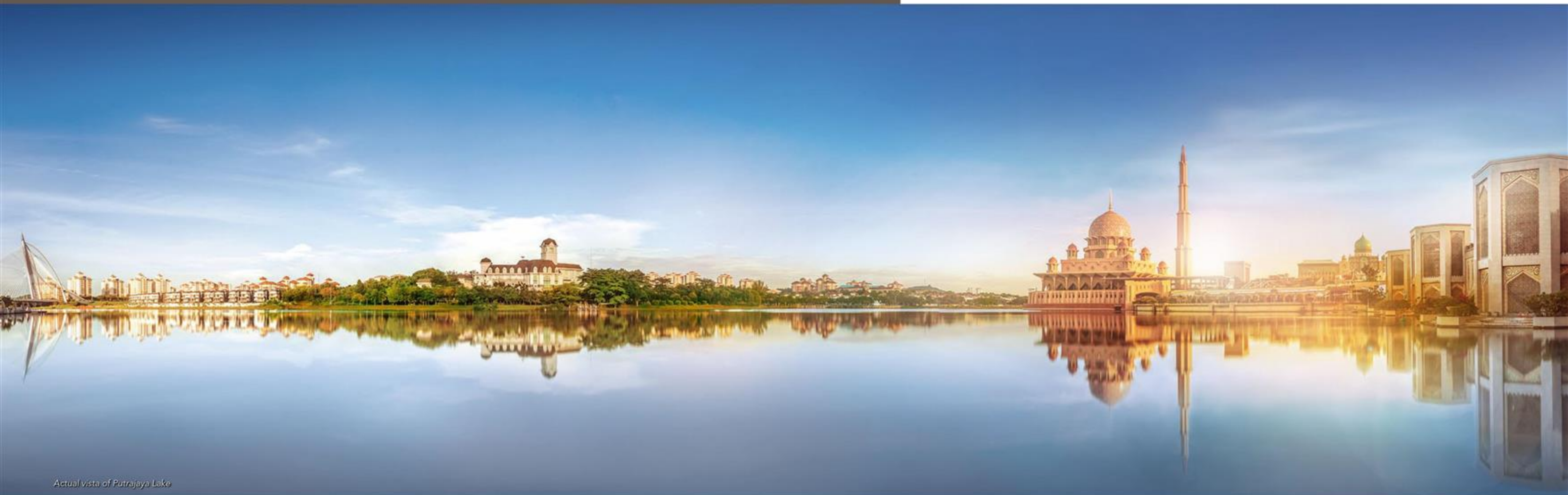
Actual vista of Putrajaya Lake