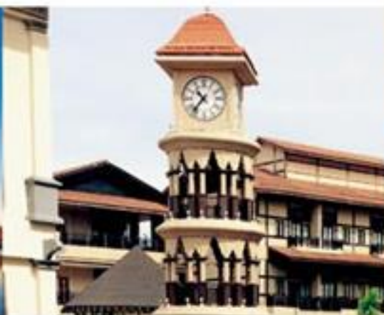
Pullman Putrajaya Lakeside Hotel