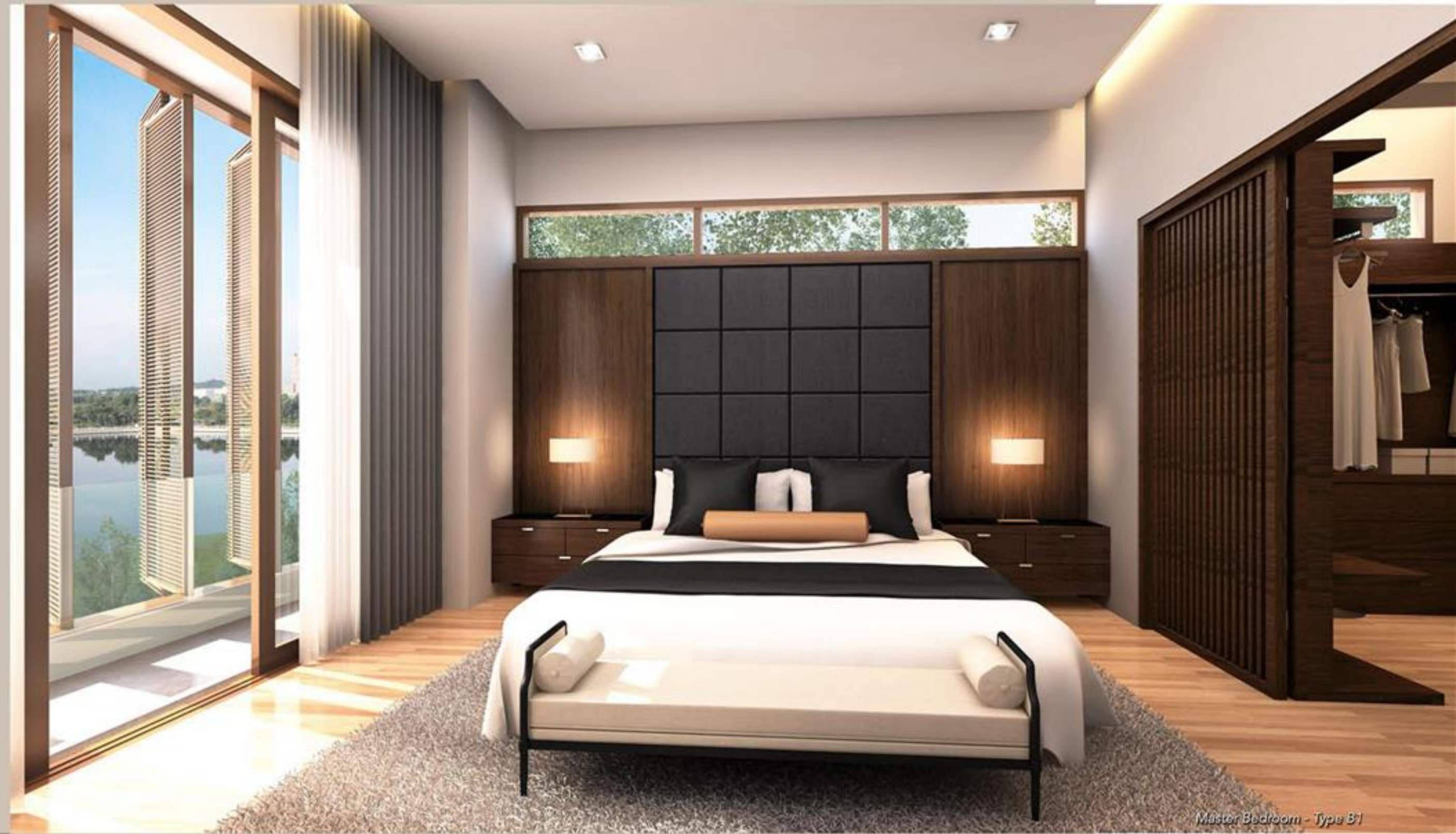
Master Bedroom - Type B1

The grand master bedroom, along with other comfortable bedrooms ensure lots of restful nights. Furthermore, luxurious ensuite bathrooms provide relaxation with a touch of class. Unwind and immerse yourself in the perfect experience.