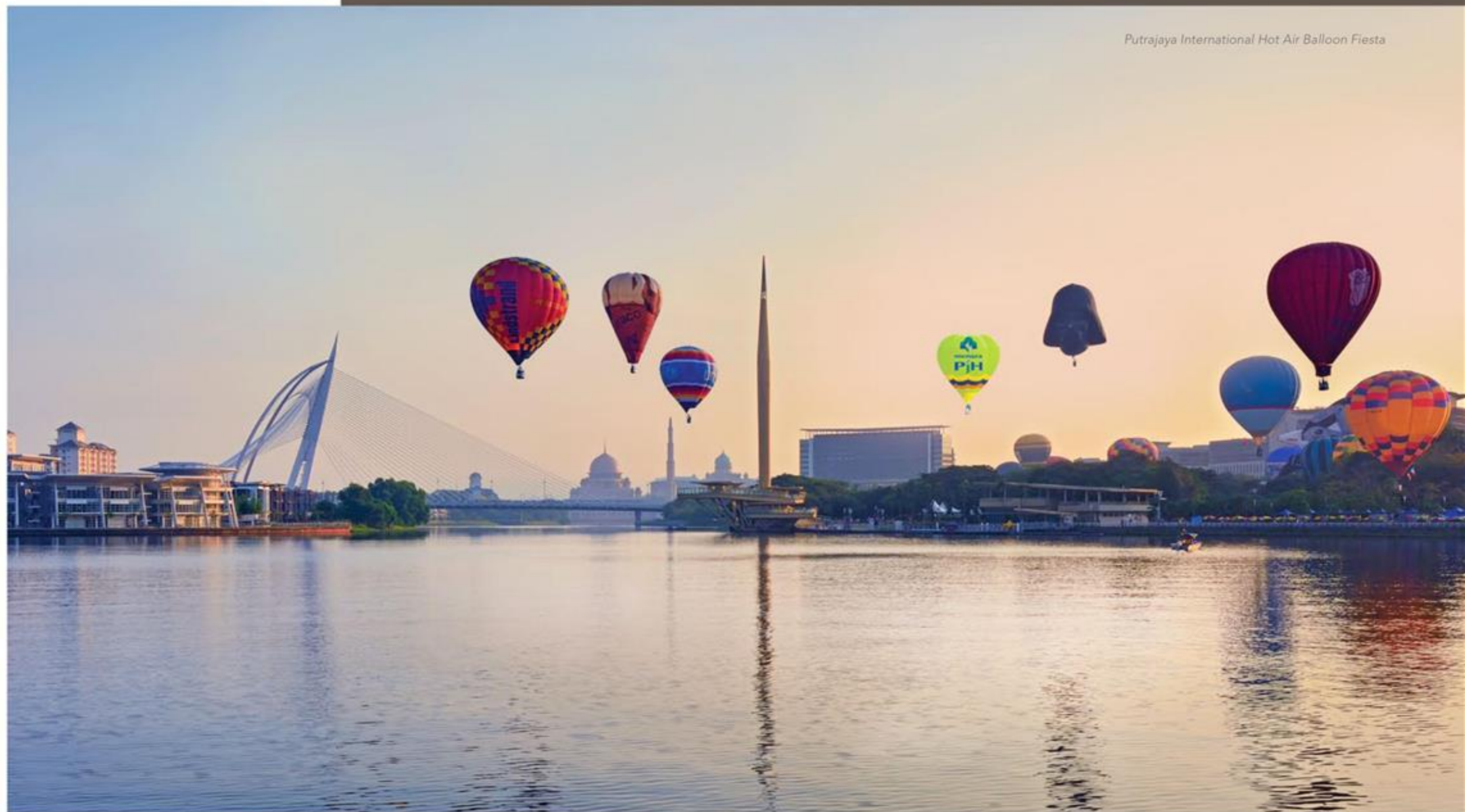
Putrajaya International Hot Air Balloon Fiesta

Putrajaya residents stand to take part in variety of recreations like sailing, windsurfing and horse riding here. Spectacular international events such as the Hot Air Balloon Fiesta, Red Bull Air Race, Dragon Boat Festival and Putrajaya International Fireworks Competition are perfect for families.