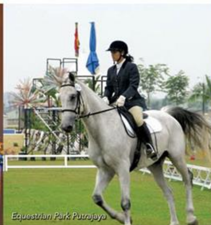
Equestrian Park Putrajaya