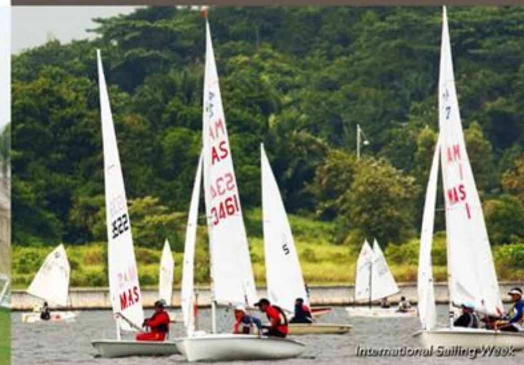
International Sailing Week