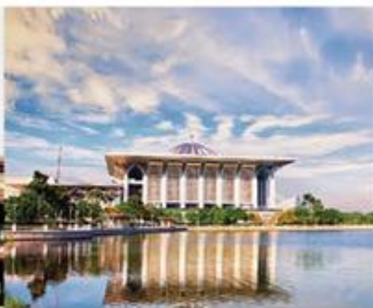
Masjid Tuanku Mizan Zainal Abidin