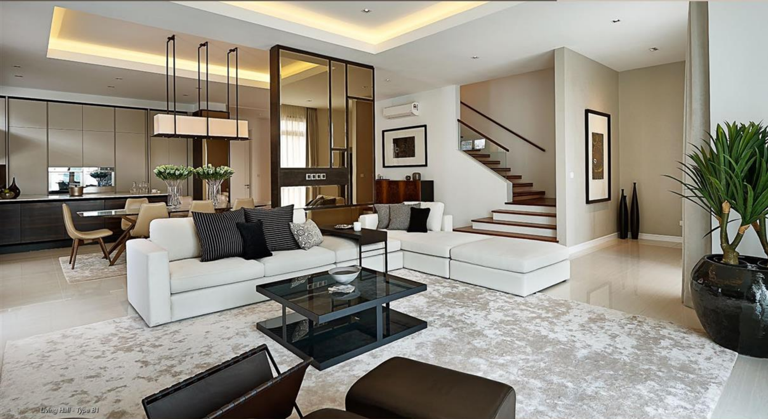
Living Hall - Type B1