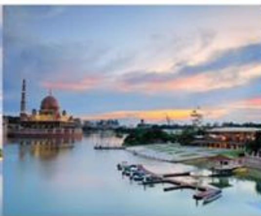
Putra Mosque & Putrajaya Lake Club