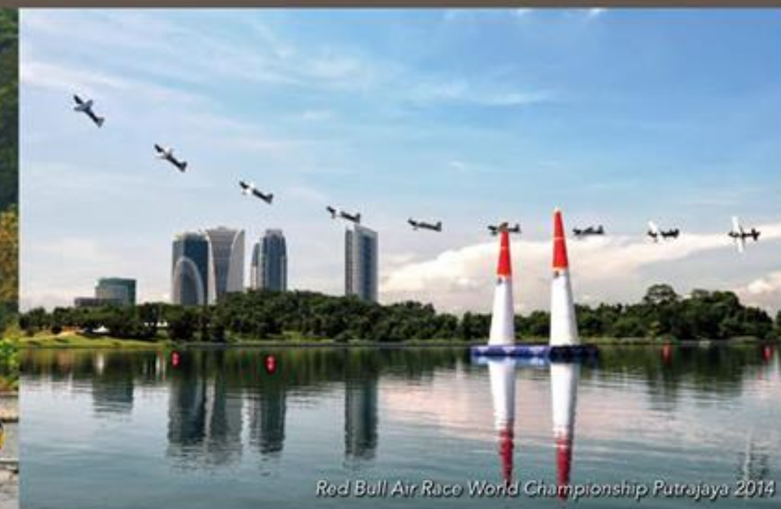
Red Bull Air Race World Championship Putrajaya 2014